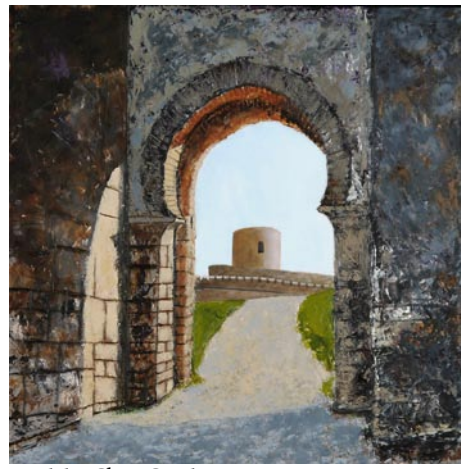
Work by Chris Graebner

The majority of Pringle Teetor's pieces for this show are cane work, a centuries old Venetian technique of putting stripes of color and patterns into blown glass. "I've always had a broad color palette and here I am able to explore endless combinations of color patterns in clean lines." The cane used in these pieces have either a colored core with clear on the outside, or veil cane, which has color on the outside with a clear core. Teetor made her veil cane with a variety of transparent or translucent colors, noting that as you look through the piece, the density of the color changes, causing interesting variations of color. Some pieces mix both types of cane, while others used strictly one or the other. In addition, several