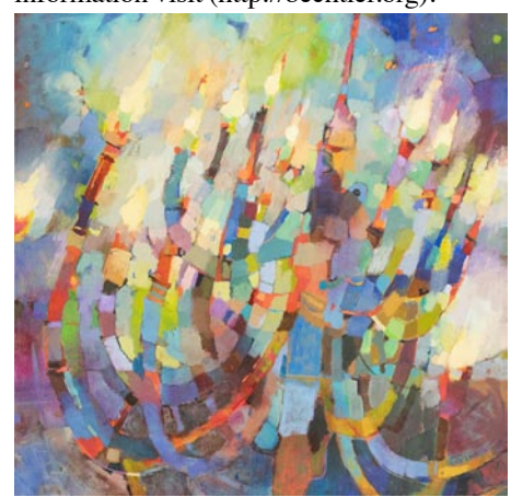
Work by Jean Cauthen

an exploration and presentation of more than 40 tapestries created by artists usually associated with painting, sculpture, and architecture, including Alexander Calder, Le Corbusier, Joan Miró, and Pablo Picasso among many others, on view in the Fourth-Floor Gallery, through Dec. 1. 2019. Nomadic Murals will highlight the museum's collection of tapestries from the mid-20th century, as well as shed light on a unique medium that has been important to many great Modern and contemporary artists. This will be the first time that the museum's entire tapestries collection will be on view. The tapestries will be hung alongside the artists' work in more familiar media to demonstrate both the stylistic consistency and the unique contributions textile production brought to their oeuvre. The title of the exhibition stems from Le Corbusier's essay "Tapestries: Nomadic Murals." For further information visit (http://bechtler.org).