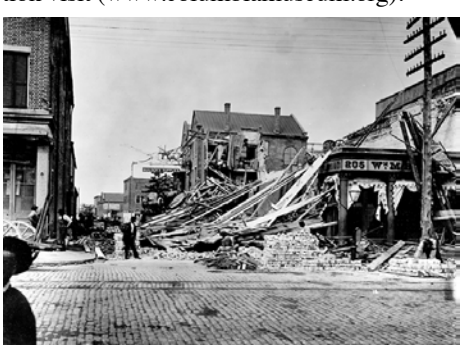
Charleston suffered widespread damage from the 1886 earthquake.