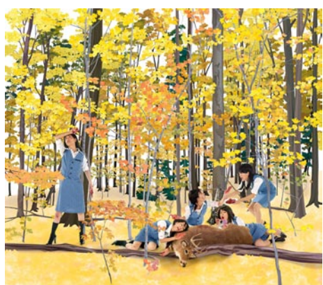
Work by Mimi Kato

continued above on next column to the right