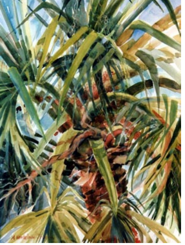
Defining Moments by Art Cornell