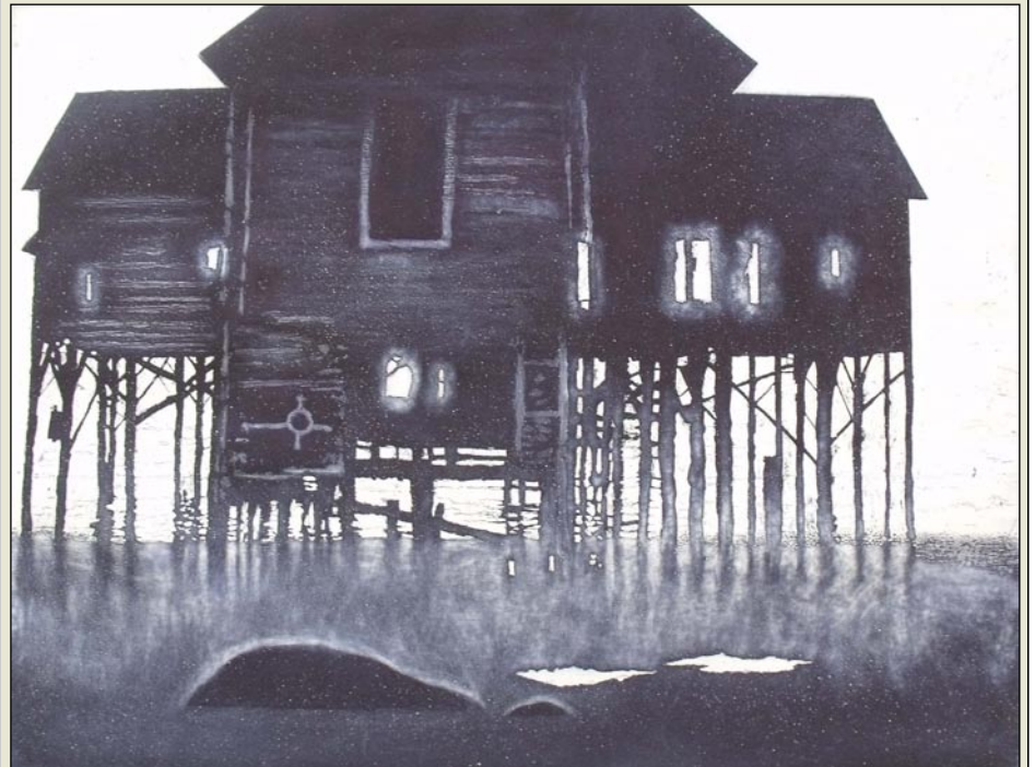
September Folly: Atlantic II, 2006 Etching 18 x 24 inches