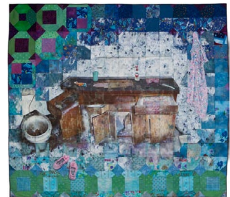
Morning Routine, by Jeana Eve Klein, 54" x 61", 2012, digital printing, acrylic paint and dye on recycled fabric; machine-pieced and hand-quilted

The majority of Klein's studio practice is devoted to mixed media quilts. These works straddle the lines between textiles and painting, realism and abstraction, fact and fiction. Her process is often obsessive, with layer-upon-layer of tedious hand processes. Klein's work has been shown nationally, appearing in more than 50 exhibitions in the last five years. Recent solo and duo exhibitions have included "Rundown" in South Carolina, "Short Stories" in Florida, "In Stitches" in Washington, and "In With the New" in North Carolina.