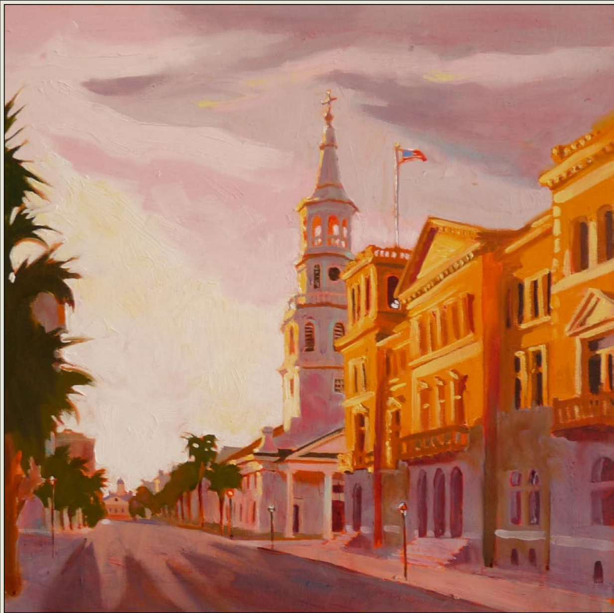
Morning Has Broken