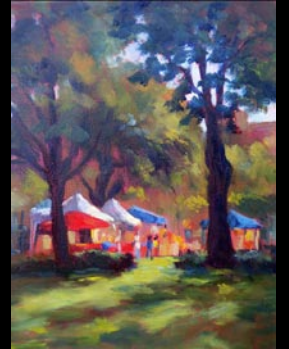
Painting by Ruth Cox

• Glass Blowing Demonstrations at 209 Laurel Street are Free! 11 am - 4 pm. Watch as glass blowers create colorful works of art from 2100 degree glass.