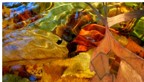
Photograph by David Young with sculpture by Julia Burr

Black Mountain Center for the Arts , Old City Hall, 225 West State St., Black Mountain. Upper Gallery, Sept. 7 - Oct. 12 - "David Young and Julia Burr: Streaming". A reception will be held on Sept. 7, from 6-8pm. These two artists, diverse in approach, training and medium, are bringing their individual perspectives together in an encounter that will arouse the viewer's curiosity and stimu-