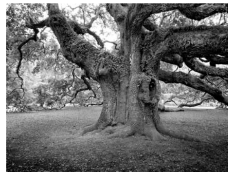
Work by Paul Shatz

The highlight of the week again is the outdoor Street Fest, Saturday, Oct. 19 – Sunday, Oct. 20, which features the juried Artist Showcase and Market on Calhoun Street with over 100 artists from 10 different states. These artists will be displaying their fine art; local restaurants and caterers will be serving up delicious seafood dish-