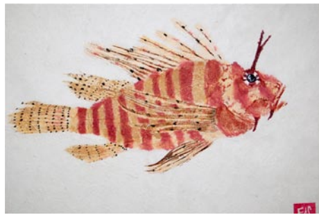
Work by C. Wondergem

The traditional opening ceremony, the Blessing of the Fleet and Boat Parade on the May River, will again kick off this week of festivities at 4pm on Sunday, Oct. 13, preceded by a Showcase of Local Art, an outdoor art exhibit from 11am – 4pm in the heart of Old Town Bluffton, and finishing the day with the first Oyster Roast