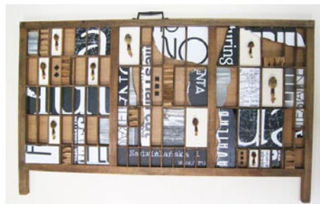
Work by Carol Williams

This exceptional collection of abstract artwork is presented by the artists of Art Beyond Tradition. This exhibition of imaginative artwork in a variety of media... paintings, collages, assemblages and sculptures in stone and metal is the artists thinking outside the box with each piece being unique. The exhibit is rich in color and design.