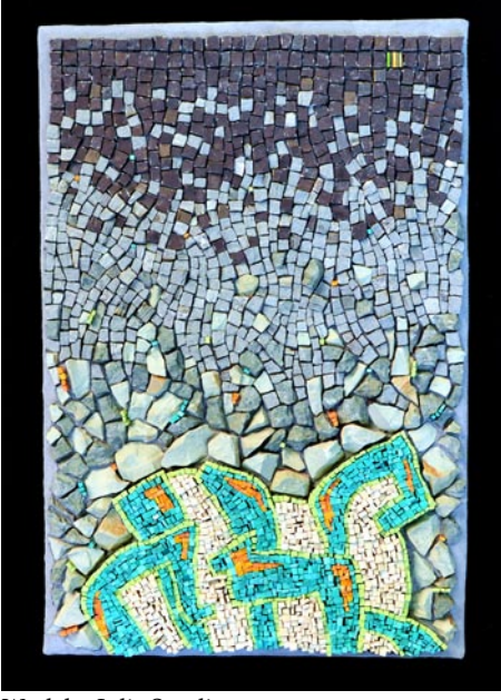
Work by Julie Sperling

Deb Aldo's Stratum explores a similar divergence in the natural world. "The horizontal layering of Balinese stone, smalti and glass is both naturally and artificially formed. This abstraction refers to the geological stratum; bands of different colored or structured material exposed