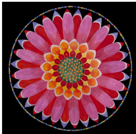
Work by Kathy Cooper

The exhibition celebrates Piedmont Craftsmen's 50th anniversary and the partnership between it and The Galleries. Since The Galleries opened in 2007 in the Cabarrus County historic courthouse, exhibitions have featured several artists who are members of the group.