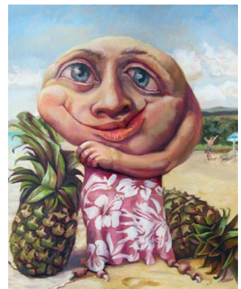
Work by Jill Eberle

Curated by Edie Carpenter, the exhibition presents 22 artists who investigate animation from 19th century animation devices to the elaboration of original animated worlds. The exhibition will explore sequential art from flip books and storyboards to Claymation, and present works on paper as well as digital media. The influence of animation on other art forms including jewelry, pottery, sculpture and painting will also be explored.