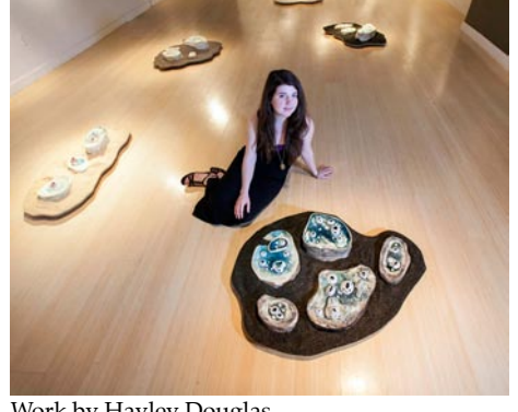
Work by Hayley Douglas

'Outer space is a vast frontier full of mystery and beauty. I have always been drawn to the vibrant images of outer space, with its bursts of color and clustered stars, spiraled galaxies and deep darkness. I have always created connections between the ocean and the cosmos, as I have found the two quite similar. The ocean is an expansive world without walls that has barely been explored. Such incredible creatures and marvels await beneath its cerulean surface. I would like to reach out and capture the beauty and