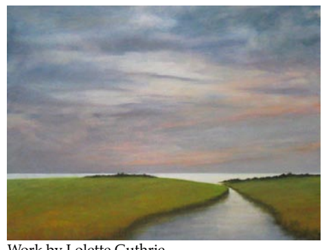
Work by Lolette Guthrie

Three artists explore the ephemeral magic of light in transforming their creative work. The exhibition is a visual conversation among three unique artists who vary in focal inspiration, creative process, and medium. The result is an exciting, rich visual display. Lolette Guthrie's serene, reflective landscapes contrast with Eduardo Lapetina's vivid, heavily textured abstract paintings. Added to this conversation are the unique mouth-blown glassworks of Pringle Teetor.