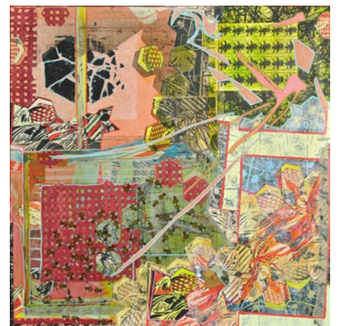
Work by Adrian Rhodes

For further information check our SC Institutional Gallery listings, call 843/661-1385 or visit ( http://departments.fmarion.edu/finearts/ ).