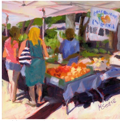
Work by Murray Sease

The Society of Bluffton Artists in Bluffton, SC, will present Summer Light , a lively collection of recent paintings by local artist Murray Sease, on display from Sept. 2 through Oct. 4, 2014. A reception will be held on Sept. 5, from 5-7pm.