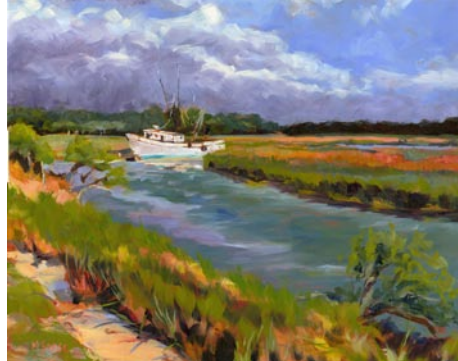
Work by Murray Sease

Sease is inspired by the vibrant local scene, especially the intense colors of the lowcountry in the summertime. She tries to catch the bustle of the farmers markets and the bountiful produce found there: the historic architecture, lush landscapes, beautiful wildlife, and some not-so-wild life—the odd farm animal and her family's chickens enjoying the cool shade and dappled sunlight. These feathered ladies