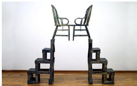
Robert Rauschenberg, "The Ancient Incident" (Kabal American Zephyr), 1981. Wood- and-metal stands and wood chairs, 86 1/2 x 92 x 20 inches (219.7 x 233.7 x 50.8 cm.). © Robert Rauschenberg Foundation / Licensed by VAGA, New York, New York.

The Carrack Modern Art , 111 West Parrish Street, Durham. Ongoing - The Carrack Modern Art features work by local artists in group and solo exhibitions, punctuated by a myriad of shorter artistic events that include outdoor projections, slam poetry, film screenings and musical performances. Hours: Mon.-Fri., noon-6pm; Sat., 2-5pm or by appt. Contact: 704/213-6666 or at ( http://thecarrack.org ).