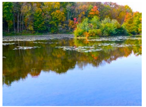
Work by Bill Cooper

Flanders Art Gallery , 302 S. West Street, Raleigh. Ongoing - Featuring a fine art gallery dedicated to the promotion of national and international artists, providing fine art to established and new collectors, and catering to special events in support of fine art. We offer sculpture, painting, photography, illustrations, engravings, and other works on paper by emerging and established artists in a range of styles. Also offering art appraisal by an ISA educated appraiser and art consultation. Hours: Wed.-Sat.,11am-6pm. Contact: 919/834-5044 or at (www.flandersartgallery.com).