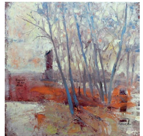
Work by Jude Lobe

Saunders goes on, "For me, each image I make is an attempt to create an abstract visual adventure for the viewer – an adventure like reading a story or listening to a piece of music. In order to do this effectively I look past the literal (i.e. a cloud, a sky, a house, a barn, a rock, a ripple in a stream, a placard,