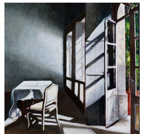
Work by Tezh Modarressi

"Modarressi's I Still Wonder Where You Are is a remarkable poetic vision of light and shadow. The light warms the interior space from a window and an open door."