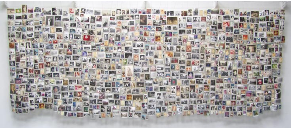
Work by Susan Lenz

USC-Beaufort in Beaufort, SC, will present Anonymous Ancestors , a solo installation by Susan Lenz, on view at the Sea Islands Center Gallery, from Sept. 2 - 30, 2016. A lecture will be offered on Sept. 30, from 4:30-5:30pm, followed with a reception from 5:30-7:30pm.