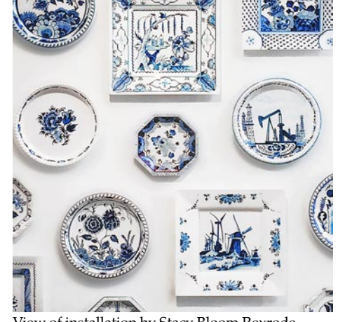
View of installation by Stacy Bloom Rexrode

Heirloom-Worthy consists of approximately 12 works, incorporating both installations and sculptural still life pieces. Included is Rexrode's sardonic and simultaneously playful installation "Quasi-Delft Bequest", an assemblage of 43 plastic plates and three plastic vases decorated with blue permanent marker in the style