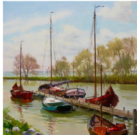
Work by Evgeny & Lydia Baranov

Edward Dare Gallery , 31 Broad Street, between Church & State Sts., Charleston. Ongoing - Located on historic Broad Street's GALLERY ROW in the French Quarter of Charleston, SC, the gallery features an extensive variety of fine art including landscape, figurative, still life & marine paintings plus exquisite pottery, photography, fine handcrafted jewelry, unique works in glass & metal plus bronze sculpture – all by some of the most sought after artists in the low country and accomplished artists from across the nation. Many of the artists represented have a personal connection to Charleston and the coastal Carolinas and tend to include pieces that celebrate the colorful tapestry of the southern coastal culture. Visit the gallery to see crashing waves, lush marshes, still lifes of camellias & oyster shells, coastal wildlife and sensitive yet powerful portraits of the south. Hours: Mon. - Sat., 11am-5pm. Contact: 843/853-5002 or at (www.edwarddare.com).