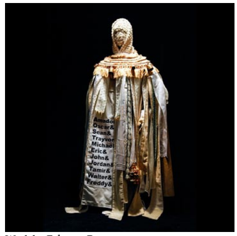
Work by Fahamu Pecou

As Pecou states, "DO or DIE is a different type of spectacle, one that distances itself from the terror and violence typically associated with Black bodies. It affirms life and life beyond. It reclaims what was lost, turning our gaze inward and ultimately forward. Through ritual, performance and image, the exhibit challenges the perception of death's dominion. Ultimately, DO or DIE is a reminder of an intimate balance that affirms life. It is art