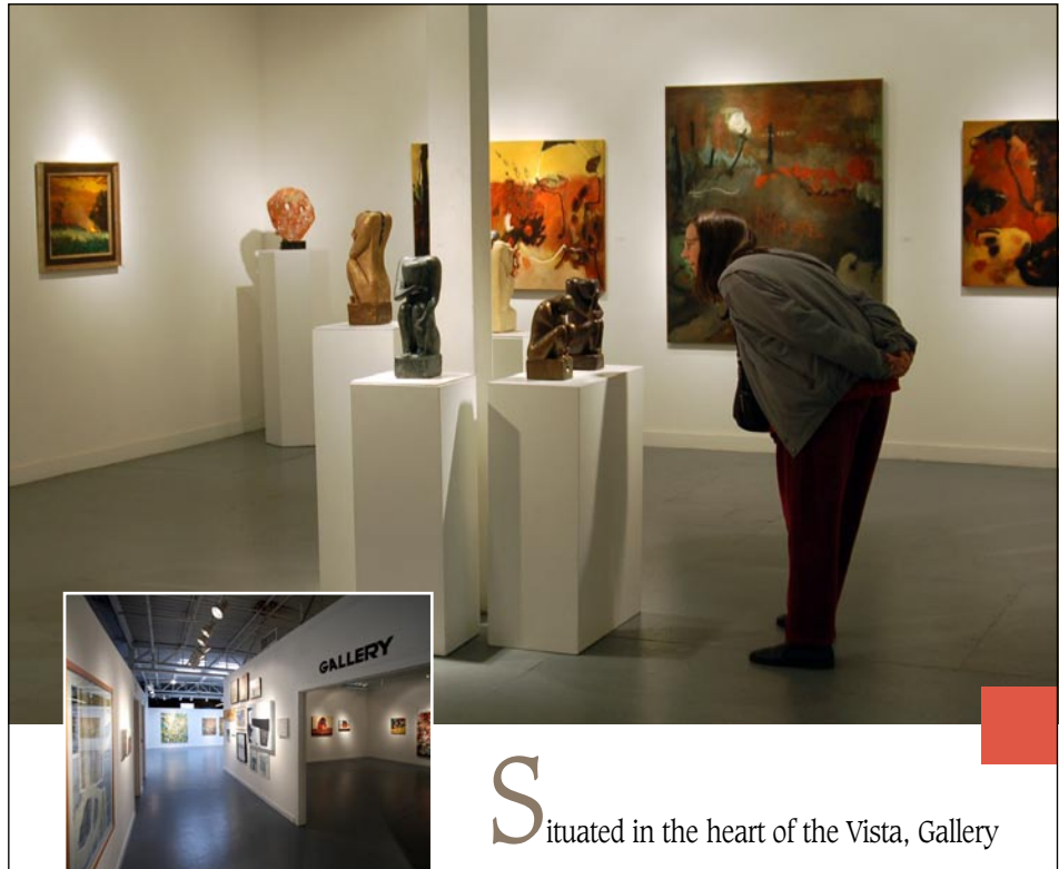
Exhibit in the

80808 is a vital part of the contemporary art scene in the Columbia metropolitan area.