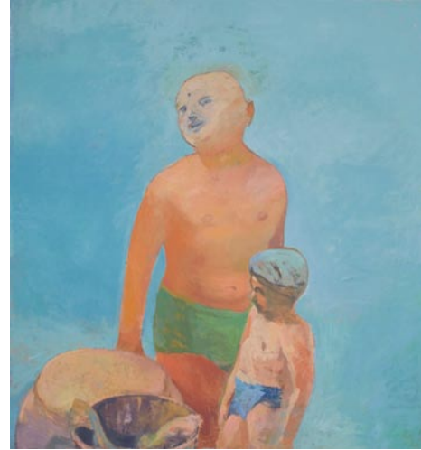
Work by Clifton Peacock

Rice grew up with the architecture of the