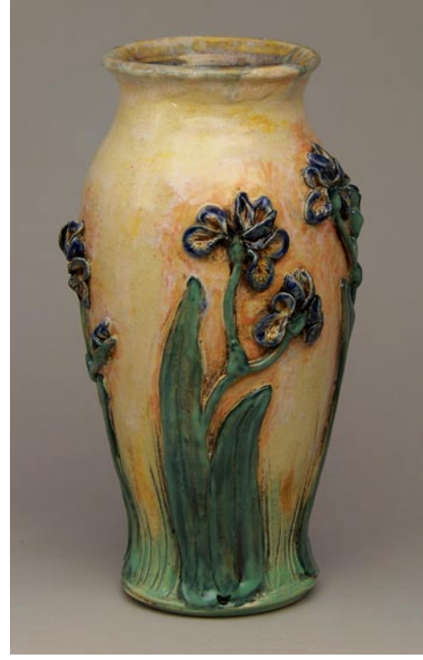
Work from Turtle Island Pottery

The weekend will include the second annual raffle with artwork donated by many of the featured artists, as well as donations from supportive Hendersonville artists and merchants. Raffle tickets will cost $2 each and winners will be announced Sunday afternoon. Proceeds from the raffle will benefit the Arts Council of Henderson County and its mission as a community organization to promote, advocate for, and nurture the arts in Henderson County and Western North Carolina.