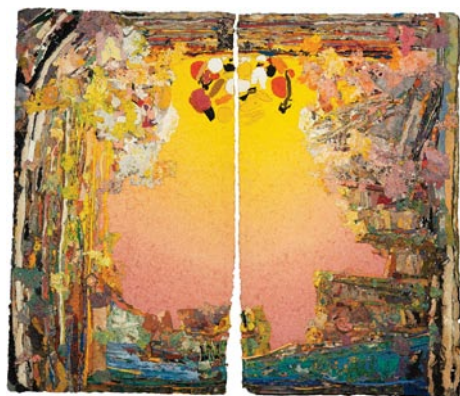
Work by Roland Poska

His process involved preparing five-gallon buckets of moist cotton fibers mixed with pure powdered pigment to achieve his desired color palette. The texture of the paper pulp varied in consistency from apple sauce to bread dough. He laid handfuls onto plastic sheeting and added elements such as handmade sliced forms and coils. After drying, Poska would flip the panel over and reveal a flattened yet technicolor abstract composition. He would then assess and sometimes alter the surface by adding more pulp, peeling away or overpainting. A sizable work could take up to six months to complete. Many works consist of multiple panels with intentionally rough and unrefined edges, a nod to the signature deckled edges of handmade paper. Late in his career, he grew his oeuvre to include large sculptures, called Sentinels, made with a similar