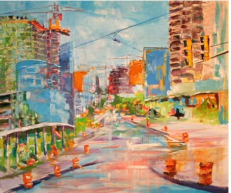
Work by Bruce Nellsmith

Nellsmith reflects on creating the sketches for Buckhead Construction : "I took the train from Midtown Atlanta to Buckhead during what was an historical water main break in the city, what was ordinarily a street filled with bumper-tobumper traffic was completely deserted. I sat in the middle of the street and produced sketches. Ironically, although there was water everywhere, one could not so