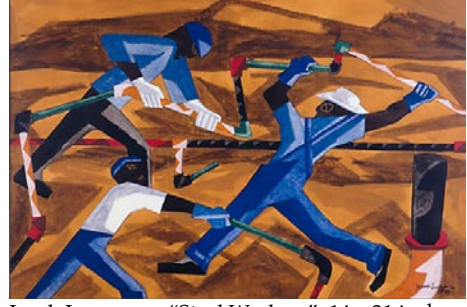
Jacob Lawrence, "Steel Workers", 14 x 21 inches, gouache on paper, 1946. Private Collection.

One of the most widely regarded American artists of the 20th century, Jacob Lawrence (1917-2000) created paintings, drawings, and prints chronicling African-American history and experience during his lifetime. Known for creating pictorial compositions that hover between abstraction and a socially inspired narrative realism, Lawrence communicated his subject matter in a direct and powerful manner through a distinctive use of expressionistic color, line, and form, organized by a sophisticated design aesthetic.