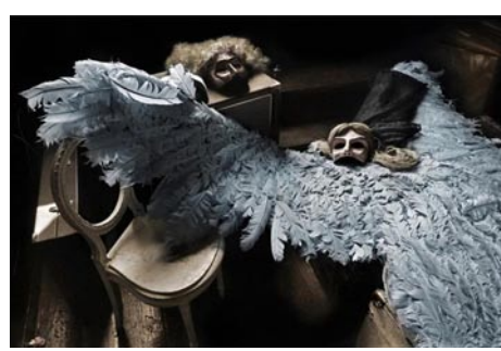
Work by Gory

Gory has not only won numerous awards, but he has had several solo and continued above on next column to the right | group exhibitions in the United States,