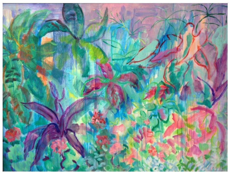
Work by Corrie McCallum