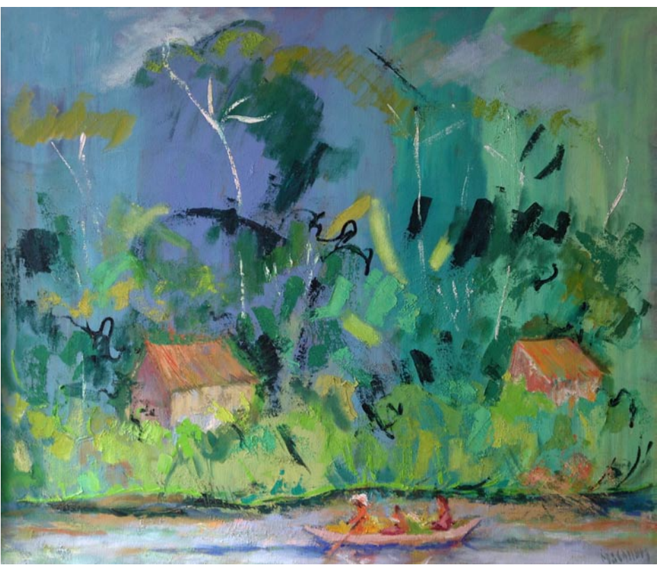
Work by Corrie McCallum

retirement. Featuring oil and acrylic collage abstractions, the exhibition will showcase McCallum's style in memorial.