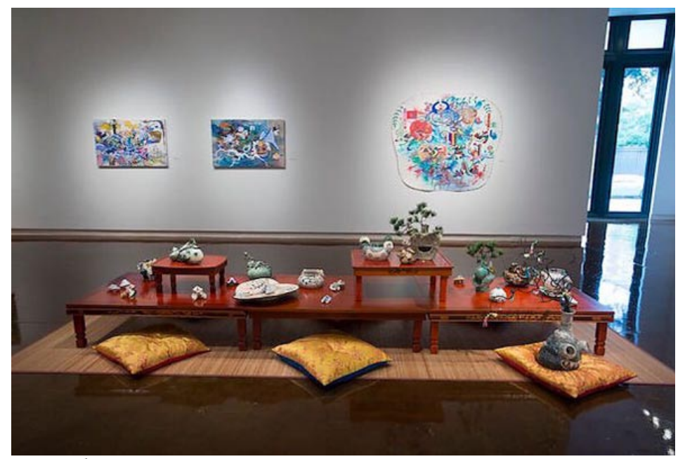
Works by Jiha Moon

ing ink and acrylic paint on Hanji paper (traditional Korean mulberry paper). Often, she places the paper on the floor and stands or kneels to apply her calligraphic brushstrokes. After completing the abstract composition in this way, Moon reconfigures some of the markings to suggest recognizable images, such as cartoon characters and incorporates mass-produced items like textiles, embroidered patches, and small trinkets with her hand-rendered elements.