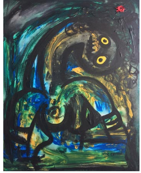
Work by Cleaster Cotton

For further information check our NC Commercial Gallery listings or visit (www.pinkdog-creative.com).