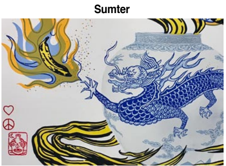
Work by Jiha Moon, detail

ALTERNATE ART SPACES - Summerville Azalea Park, Main Street and West Fifth Street South, Summerville. Ongoing - Featuring 21 pieces of sculpture in Summerville's permanent outdoor collection donated by Sculpture in the South and a few others in other locations in Summerville. One of the sculptures is located in Hutchinson Park, Summerville's Town Square. Hours: daylight hours. Contact: 843/851-7800 or at (www.sculptureinthesouth.com).