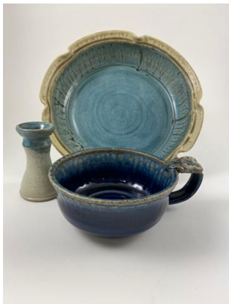
Works from Jeffcoat Pottery