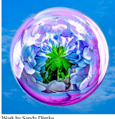
Work by Sandy Dimke

Art League of Hilton Head Gallery, at the Arts Center of Coastal Carolina, 14 Shelter Cove Lane, Hilton Head Island. Sept. 1 - 26 - "Earth to Sky". The SC chapter of National Association of Women Artists, an elite group of 47 painters, mixed media artists, sculptors and photographers, is showcasing juried member works inspired by the beauty and solitude of land and sky. The artists and their works represent an eclectic mix of styles and media. From bright and bold to monochromatic and somber, from naturalistic to abstract, the pieces all celebrate our vast earth and beautiful skies. Ongoing -Featuring works by members of the Art League of Hilton Head. Hours: Mon.-Sat., 10am-4pm. Contact: 843/681-5060 or at (www.artleaguehhi.org).