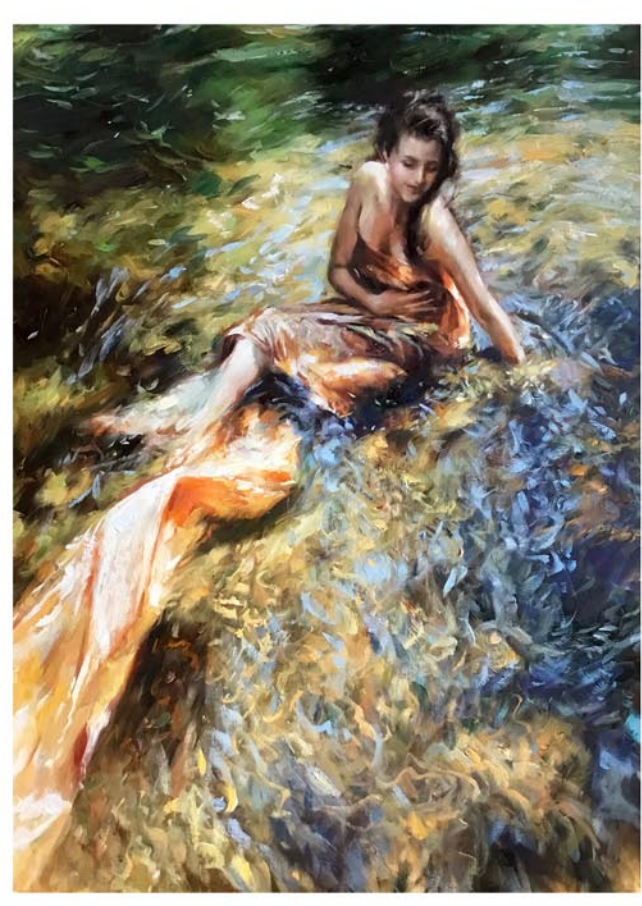
A Group Show In the Gallery and Online August 21 - September 21

"It seemed about time that we had an continued on Page 6