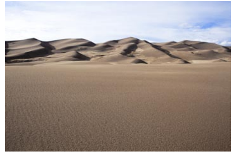
Work by Joanna Biondolillo

NAWA is made up of over 800 professional women artists. Works done by NAWA members are included in collections at The Smithsonian Institution Archives, The Museum of Modern Art, the Metropolitan Museum of Art, the Library of Congress, and other American institutions.