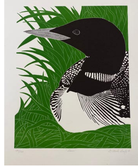
Work by G. Clark Sealy

The body of work available for bid includes a private collection of vintage prints and posters from an anonymous donor. The Great Frame-Up, a Bluffton frame shop, donated plastic sleeves for