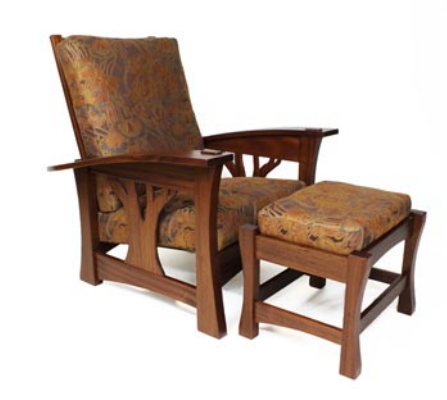
Work by Brian Brace

The Southern Highland Craft Guild, chartered in 1930, is today one of the strongest craft organizations in the country. The Guild currently represents nearly 900 craftspeople in 293 counties of 9 southeastern states. During the Depression the Guild cultivated commerce for craftspeople in the Appalachian region. This legacy continues today as the Guild plays a large role in the Southern Highlands craft economy through the operation of four craft shops and two annual craft expositions. Educational programming is another fundamental element of the organization, fulfilled through integrated educational craft demonstrations