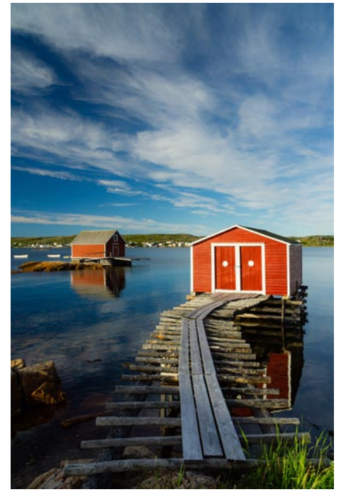
Work by Chuck Reback

With no formal art education or training but having always appreciated photography Page 20 - Carolina Arts, October 2018