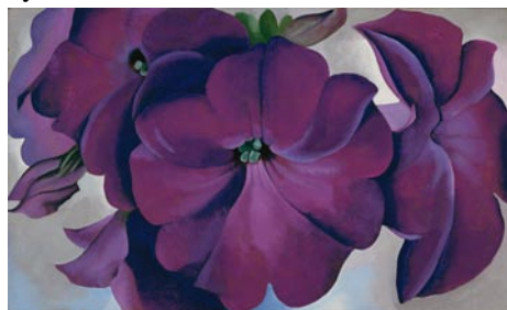
Georgia O'Keeffe, "Petunias", 1925, oil on hardboard, 18 x 30 in., Fine Arts Museums of San Francisco, Museum purchase, gift of the M. H. de Young family, 1990.55