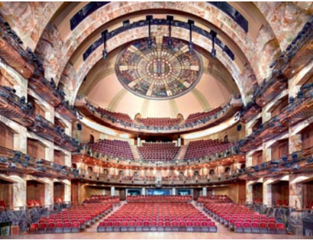
Candida Höfer, "Palacio de Bellas Artes Ciudad de México III", 2015, chromogenic print, 70 7/8 x 84 1/4 in., Courtesy of the artist, © 2017 Candida

For decades photographer Candida Höfer (German, born 1944) has made "portraits" Page 34 - Carolina Arts, October 2018