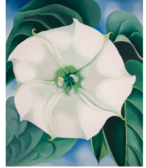
Georgia O'Keeffe, "Jimson Weed/White Flower No. 1", 1932, oil on canvas, 48 x 40 in., Crystal Bridges Museum of American Art, Bentonville, Arkansas.

Georgia O'Keeffe pioneered revolutionary ways of visually interpreting the world, leaving a lasting legacy for artists working today. This innovative exhibition brings together more than 35 of O'Keeffe's works as the centerpiece of an exploration of her