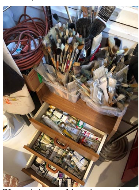
When painting out of doors these are the oils she uses. Generally inexpensive brushes are preferred to refined sables because it keeps the brushwork loose.