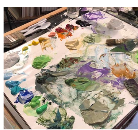
A disposable paper palette is used for her acrylics.