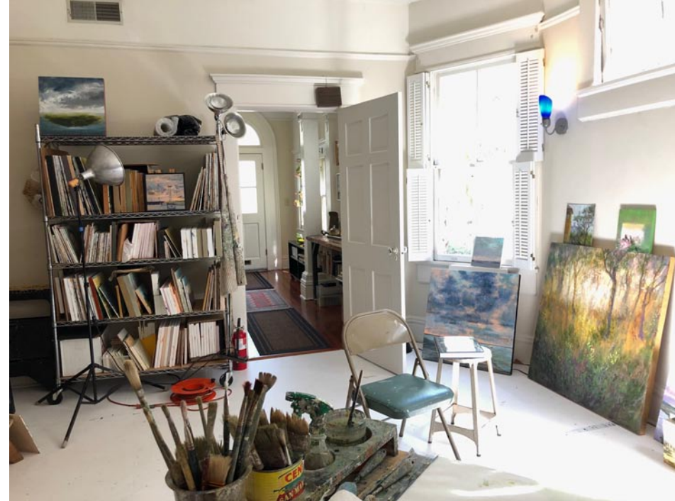
Metal shelving holds smaller works on canvas and wood panels.