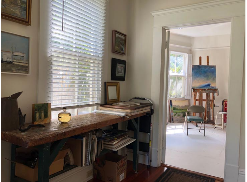
The foyer serves as a storage area and has a substantial work bench for building stretchers and frames.