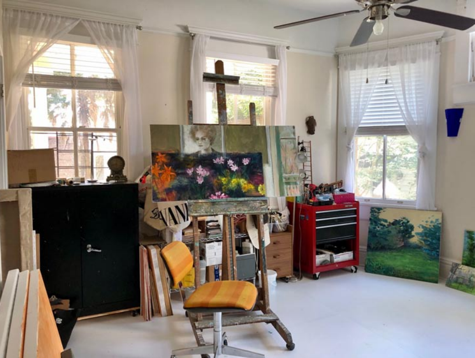
Studio 2 has windows to the west and south on the porch. Everything is on wheels permitting rearrangement in order to accommodate various projects.