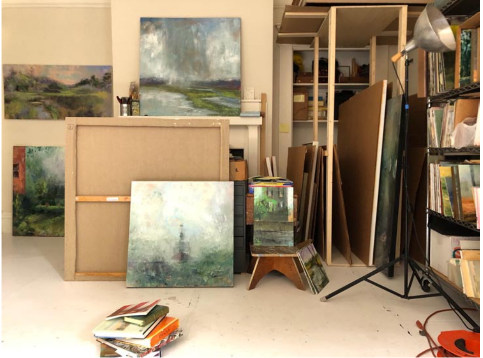
A tall painting rack stores several of her larger works.