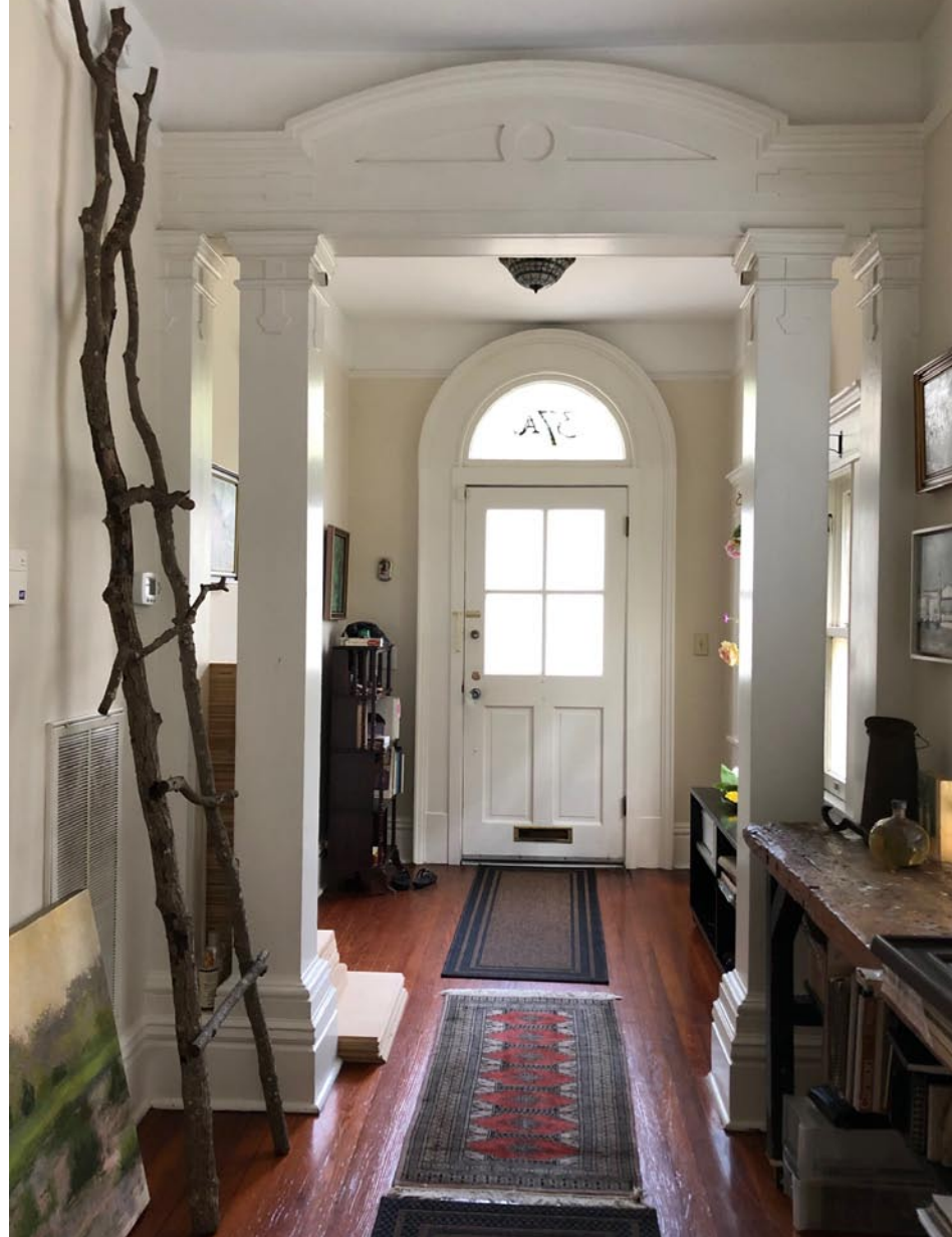
This is the front entry which is also useful for storage as well.