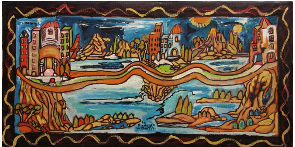
Work by Rudolph Valentino Bostic

American Folk Art in Asheville, NC, present Rudolph Valentino Bostic: A Fond Farewell Show, with an exclusive website preview & sales beginning Oct. 5, 2021, at (www.amerifolk.com) and on view in the gallery, from Oct. 7 - 21, 2021.