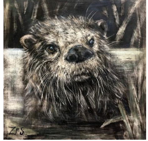
Work by Zoe Schumaker

"Nature fascinates me. Through painting, I feel a deeper connection with the wonder, beauty and perfection of the natural world. I hope that viewers will connect with the beauty and personality of each animal, recognizing how each one brings