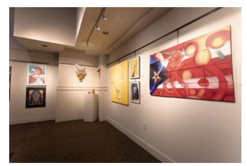
View of the "LatinXhibit"

LatinXhibit celebrates the rich and diverse influence Hispanic and Latino artists have on the history and impact of main-The Arts Center's gallery flourishes with the vision, flair, and passion of art pieces created by prominent and emerging Hispanic and Latino artists from across the country. This collection of extraordinary modern and contemporary artwork and sculptures express the beauty of diversity through the artistry and perspective of Hispanic and Latino visionaries. Throughout history, creative ventures by Hispanic and Latino artists were pushed to the background of mainstream American art and seldomly given the opportunity to be center stage. Nevertheless, the rise and significance of artistic Hispanic and Latino trailblazers have made their mark as leading innovators in the art scene, thus, solidifying their rightful place in the progression of American art and defining their relevance and impact throughout all art disciplines. Today, the contributions of Hispanic and Latino artists are undeniable as they continue to change the face of artistic explorations globally with new curatorial narratives that are driven by their cultural experiences. Making the inaugural LatinXhibit a