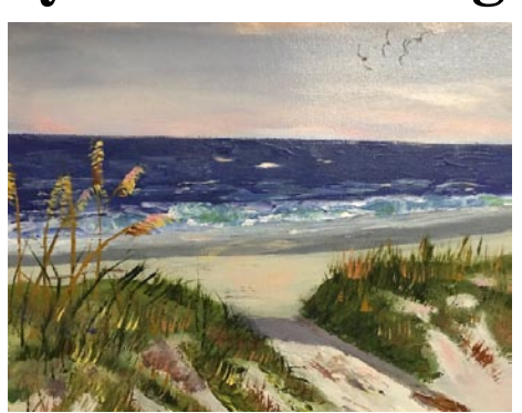
Work by Sandra Wenig

is the heart of the flourishing art hub in Old Town Bluffton's historic district at the corner of Church and Calhoun streets. As a non-profit art organization, SOBA offers regular art classes, featured artist shows, exhibitions, scholarships, outreach programs and more.