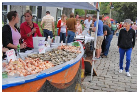
Scene from a previous festival

Fishing Tournament and children's art activities in the park.