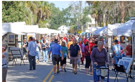
Scene from a previous festival

Along with the traditional Blessing of the Fleet and Boat Parade on the May River on Sunday, Oct. 16, the local art scene will again be highlighted as we kick off this week of festivities. Our Sunday activities include a Showcase of Local Art, at the galleries and an outdoor art exhibit in Martin Park from 11am – 4pm in the heart of Old Town Bluffton, as well as the first Oyster Roast of the season at Bluffton Oyster Park at 5pm.