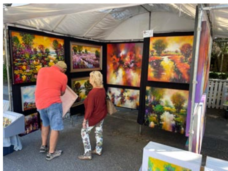
Scene from a previous festival

The SYMPHONY IN THE PARK featuring the sweet sounds of Hilton Head Symphony Orchestra which debuted last year is returning this year also. This Outdoor Pops concert "under the stars" is FREE for one and all. Bring a blanket or chair, a picnic dinner and enjoy your HHSO and JMR al fresco. General lawn seating with free admission.