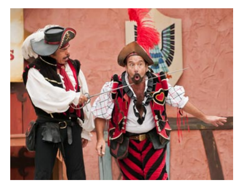
View of the Don Juan & Miguel show

The Renaissance Festival is the largest costume party in the Carolinas. Visitors can come as they are or to join in the spirit by visiting the village in costumes of all types. Each weekend has unique themes with many having costume contests with prizes and discount admission opportunities. Returning popular weekends like Halloween Daze & Spooky Knights, Pirate's Christmas, and Time Travelers' Weekend embrace visitors in non-renaissance costumes such as those dressed as superheroes (and villains) and characters inspired by Harry Potter, Games of Thrones, Lord of the Rings, and more. Visitors can wear their own costumes or acquire them at the village costume rental shop located just outside the Festival gates. Also available for rent are wagons, strollers, wheelchairs. And new for