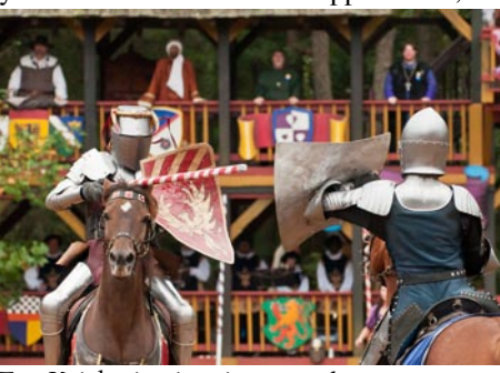
Two Knights just jousting around stage or off.

Each Festival day is filled with an abundance of attractions. The 25-acre village of Fairhaven has sixteen stages packed with costumed performers offering a unique mix of continuous music, dance, comedy, and circus entertainments. Swimming mermaids, Birds of Prey Falconry demonstrations, and the popular Jousting Tournament with horse mounted armored knights battling three times daily are all examples of the endless entertainment options offered. The shows are always spontaneous, and you will never know what happens next, on