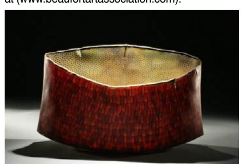
Work by Curtis Benzle

Beaufort Art Association Gallery,913 Bay Street, across the street from the Clock Tower, Beaufort. Ongoing - New works by more than 90 exhibiting members of the Beaufort Art Association Gallery - exhibits and featured artists change every six weeks. In addition to framed paintings in a variety of media, the gallery offers prints, photographs, unframed matted originals, jewelry, sculpture, ceramics and greeting cards. Hours: Tue.-Sun.,11am-4pm. Contact: 843/521-4444 or at (www.beaufortartassociation.com).